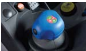
Standard Remote Management System (RMS) joystick.

A "float position" also allows the operator to release pressure on the lift arms, enabling the attachment to follow the ground surface.