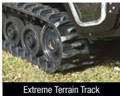
Extreme Terrain Track

Turf Tracks. For applications where the ground is soft, wet or swampy, consider the wider Extreme Terrain Tracks with deep tread lugs for extra gripping power.